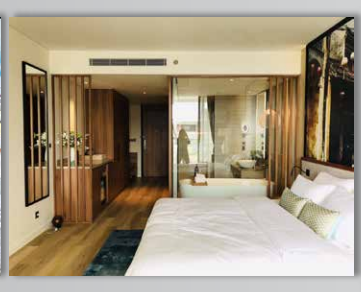
The condotel model of Malibu Hoi An